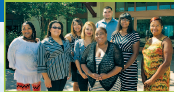
HACSB's 2014 Scholarship Awardees pictured, from left to right:

For 23 years, HACSB has awarded college scholarships to resident students. This year eleven students were awarded almost $12,000 combined to help pay for educational expenses. The scholarship recipients are attending the following colleges/universities: California State University, San Bernardino; Chaffey Community College; Grand Canyon University; San Bernardino Valley Community College; University of California, Riverside; and West Coast University. Areas of study include majors such as accounting, biology, business, child development, computer science, human services, marriage family therapy, Master's in social work, nursing, psychiatric nursing, and social work.