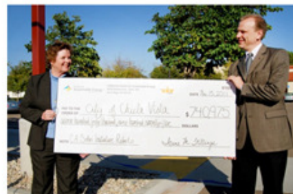
Chula Vista Mayor Cheryl Cox receives a $148,272 CSI check from CCSE's Andrew McAllister.

"Over the last year, approximately 1,900 solar photovoltaic panels have been installed at 11 municipal facilities on rooftops and carports," said Mayor Cox. "The new solar arrays, which produce an equivalent amount of energy to powering 125 homes annually, represent a seven-fold increase in the City of Chula Vista's renewable energy capacity and help to reduce its carbon footprint."