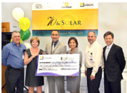
Southern California Edison awarded its first and largest MASH Track 2 Grant ($1.84 million) to the Housing Authority of San Bernardino for Maplewood Homes solar project by HelioPower.