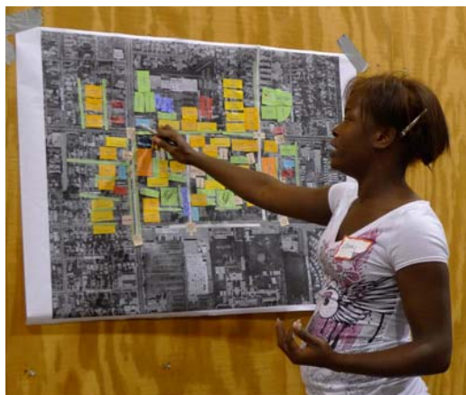
Community member analyzing the current layout and providing feedback for change.