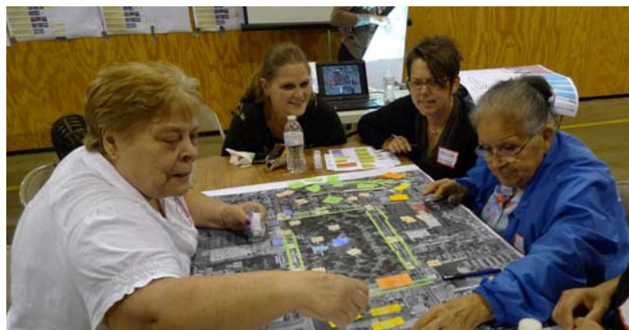
Community members of all ages participated in the hands-on activities to sketch out the possible layouts for the upcoming neighborhood revitalization.